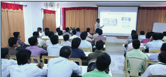
Company presentation by Texmo to students