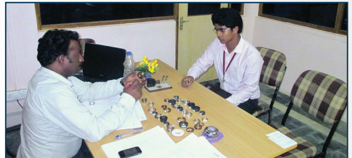
During HR interview of Rolonseals